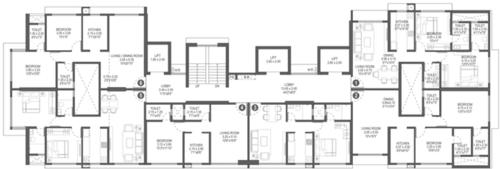
AREA STATEMENT IN SQ.M. & SQ.FT.