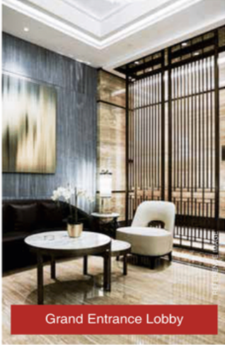
Grand Entrance Lobby