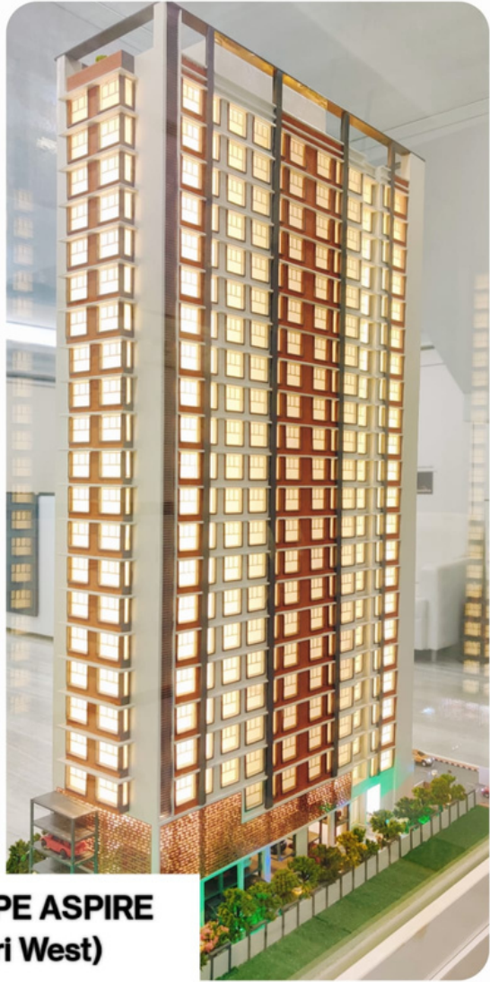
PARANJAPE ASPIRE (Andheri West)