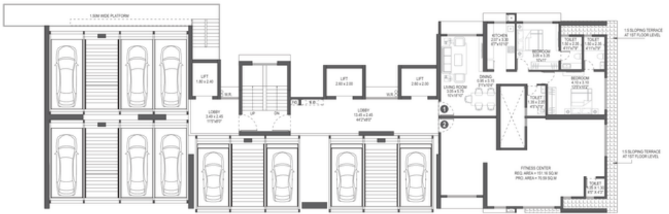
AREA STATEMENT IN SQ.M. & SQ.FT.