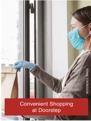
Convenient Shopping at Doorstep