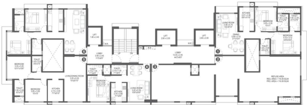
AREA STATEMENT IN SQ.M. & SQ.FT.