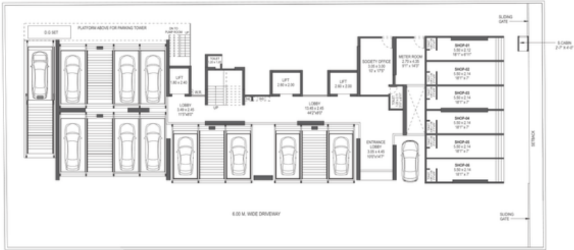
AREA STATEMENT IN SQ.M. & SQ.FT.