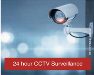
24 hour CCTV Surveillance