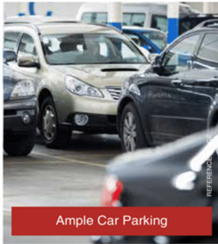
Ample Car Parking