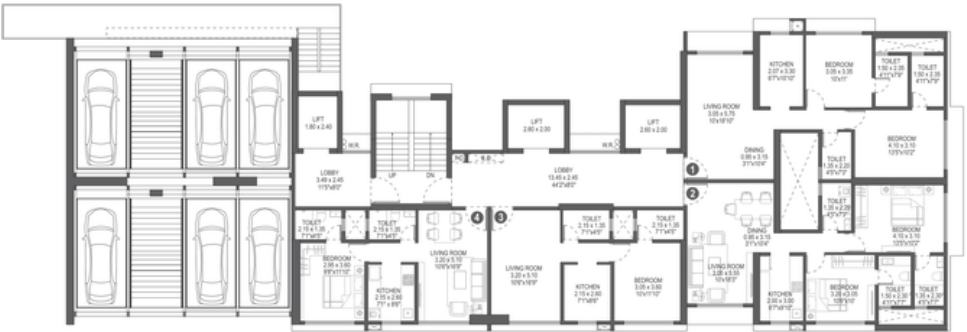
AREA STATEMENT IN SQ.M. & SQ.FT.