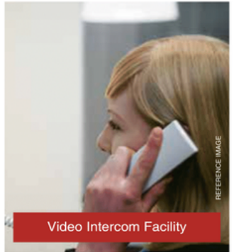
Video Intercom Facility