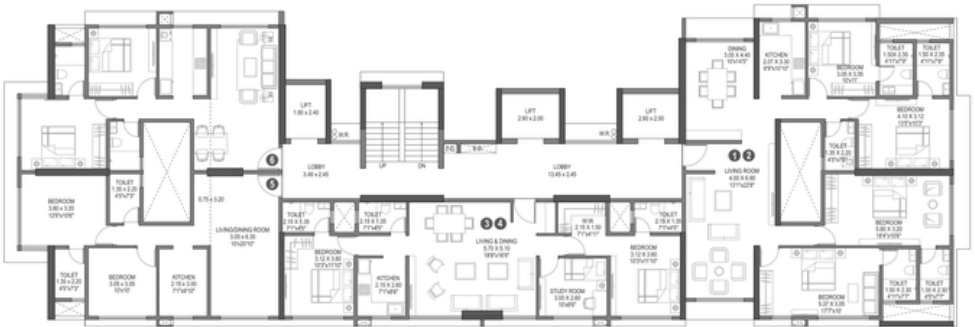
AREA STATEMENT IN SQ.M & SQ.FT